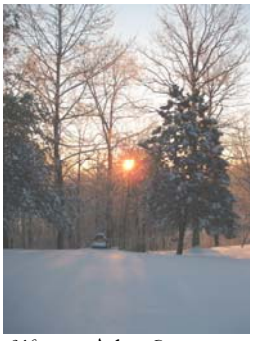
Happy New Year to All!

Another new year has begun! New beginnings are always good times to reflect and take note of some things that need our attention and improvement. I always wonder what the new year will hold; what events will take place in our nation, what God will do in our home and family, who may be with the