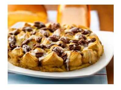
(This is great! Made it for Christmas!)