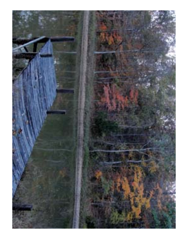
Autumn colors off our dock.

Jewels For His Crown RR1 Box 1436 Mill Spring, MO 63952 PDF downloadable version at: www.spbiblechurch.com