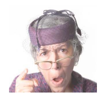
If you mess up, 'fess up. ~Author Unknown

"I must do something" always solves more problems than "Something must be done." ~Author Unknown