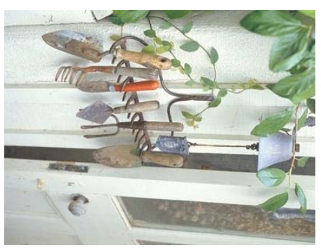
A good organization idea from Pinterest!

PDF downloadable version www.spbiblechurch.con