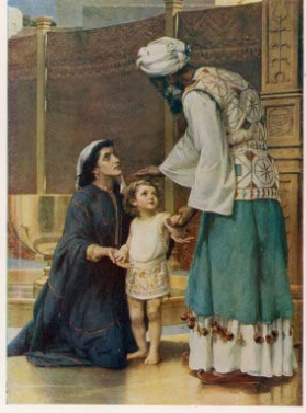
"HANNAH DEDUCTING THE INPANY AAMUEL AT THE TABERNACLE"